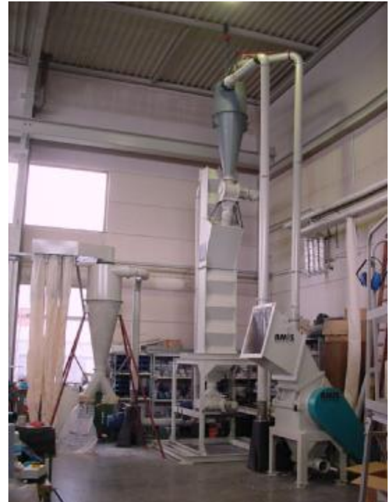
Pic .2 Separator with pneumatic feeding and discharge system for light fraction..

Through cascades creates an extremely effective material separation.